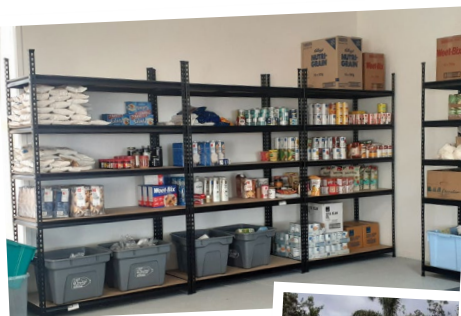
Above: New shelves and painted floors, thank you Saint Kentigern School weekend warriors!