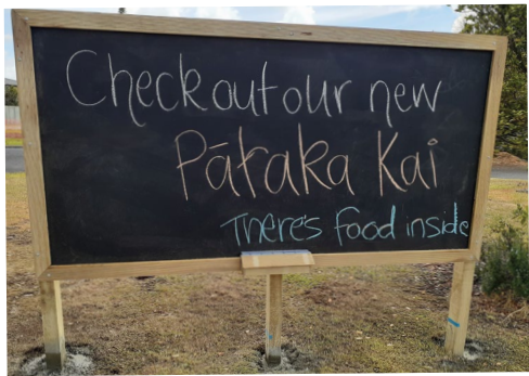
New Blackboard in front of the Kai Space, built by the Auckland Central Community Shed.